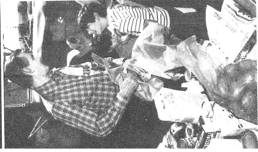
'IT MAKES ME FEEL WONDERFUL,' says Weaver, who is shown giving away food to needy kids.